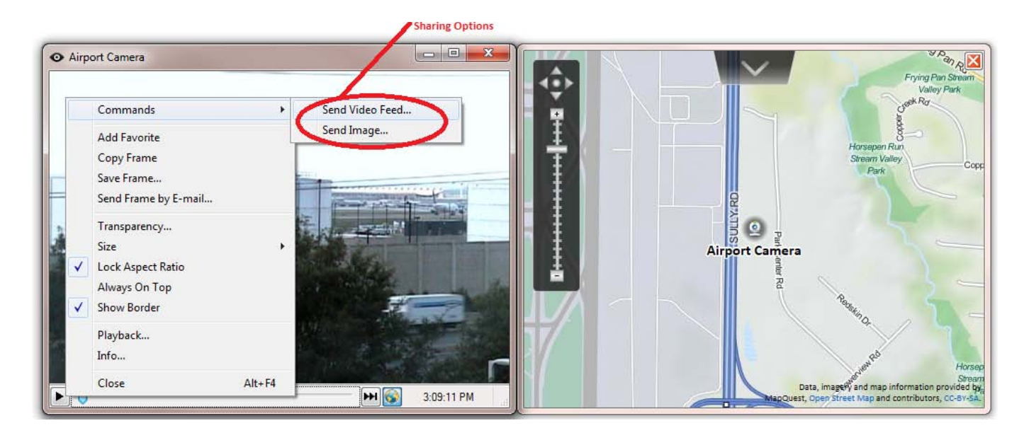
Sharing a video feed or a single image

By leveraging our patented peer-to-peer technology, our Windows PC users can share video feeds they are viewing with any other user on the system. This includes both transmits being created by the PC user and other RealityVision sources the user may be watching on their PC, such as IP camera feeds, video files or RealityVision Screencasts. Other available metadata associated with the video feed, including location information and user-generated text tags, are shared as well for enhanced context. Depending on the source, the feed can be shared live, from a paused point, or from the beginning of archived footage. In all cases, the recipients can also share received feeds with other authorized users to further the collaborative process.